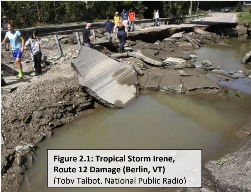
Figure 2.1: Tropical Storm Irene, Route 12 Damage (Berlin, VT)